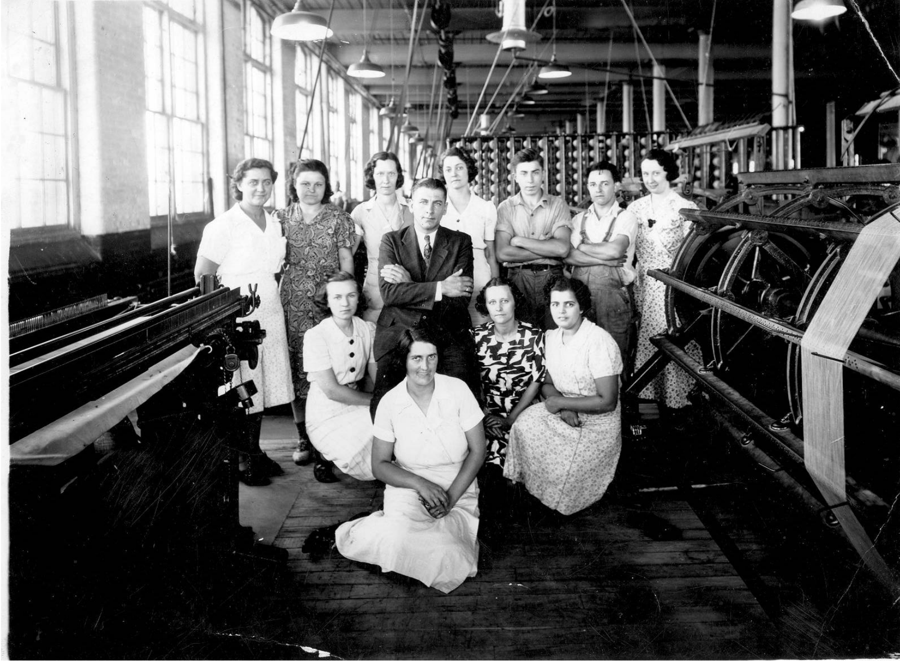
Blackstone: A Case Study in Immigration The John H. Chafee Blackstone River Valley National Heritage Corridor National Park Service